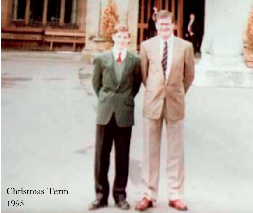
Christmas Term 1995